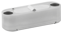
Typ 0 Type 0